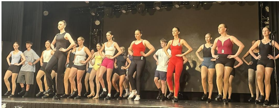
Tap Scholarship Class