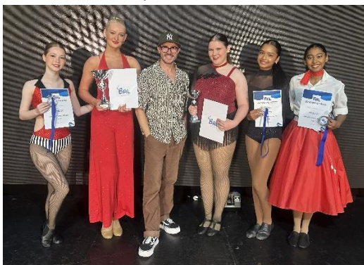
Jazz Scholarship Winners & Finalists