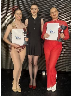
Tap Scholarship Winners