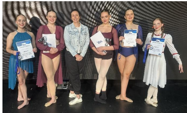
Ballet Scholarship Winners & Finalists