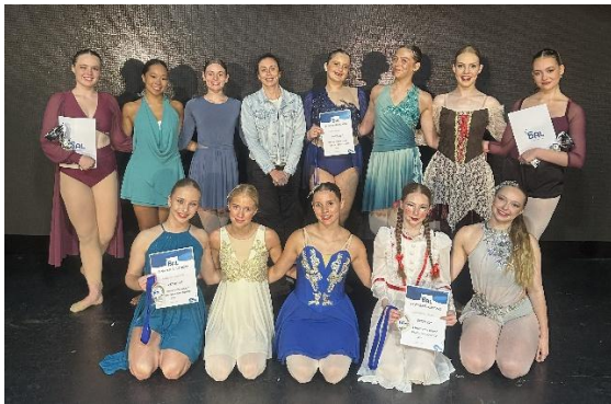
Ballet Scholarship Group