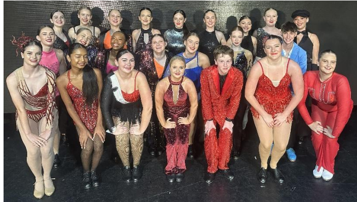
Tap Scholarship Group