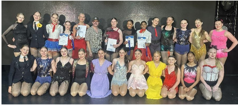
Jazz Scholarship Group